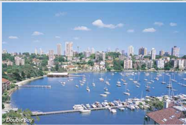
> Double Bay

■ DISCOVER GUIDES ONLINE For information and links go to : www.discovergreatersydney.com.au