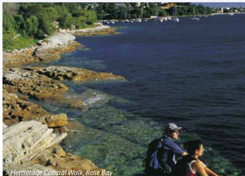
> Hermitage Coastal Walk, Rose Bay