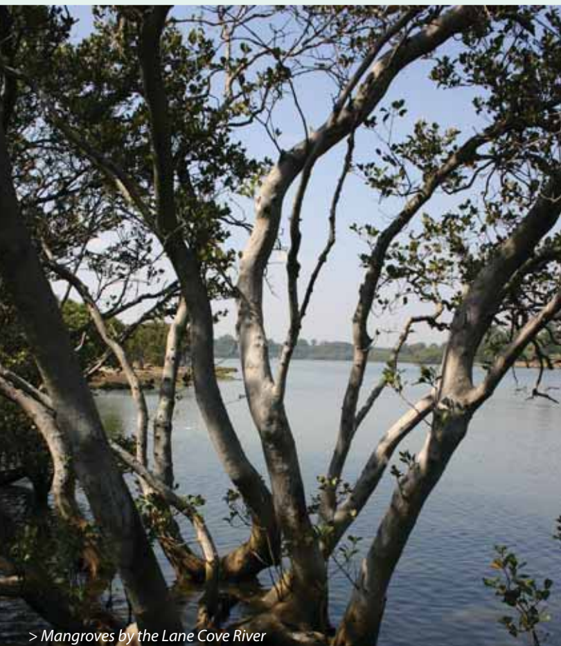
> Mangroves by the Lane Cove River