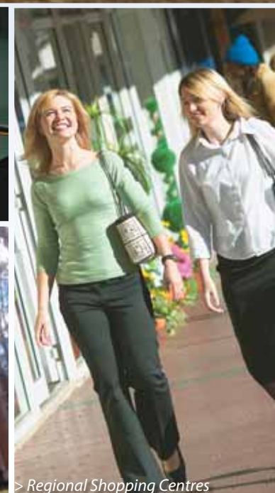
> Regional Shopping Centres