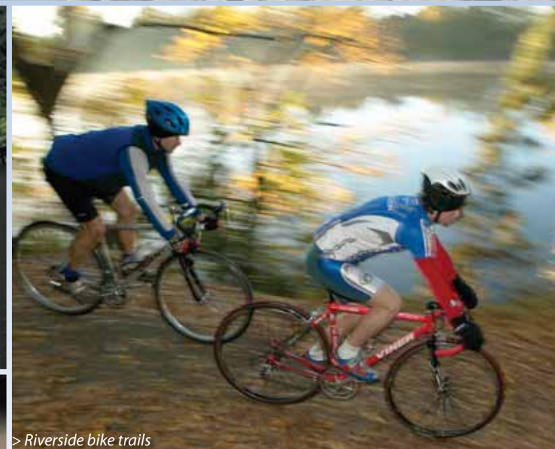
> Riverside bike trails