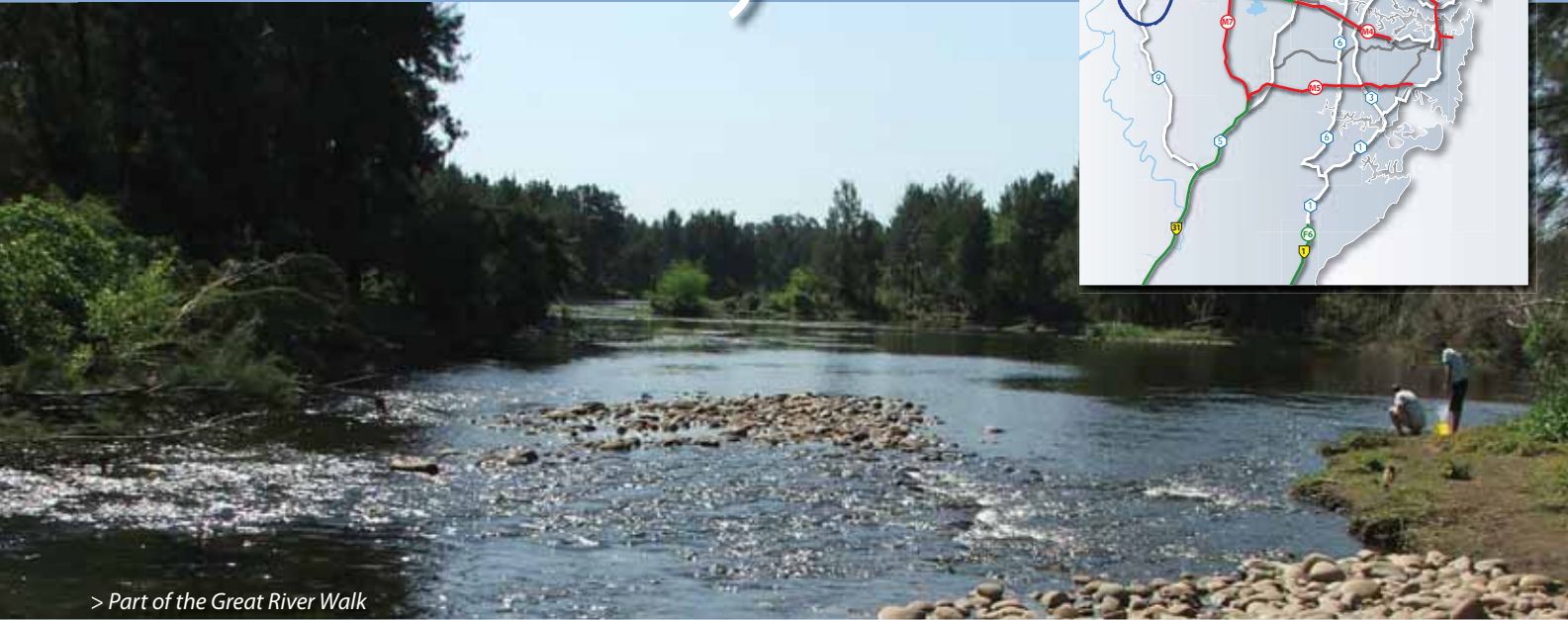
> Part of the Great River Walk