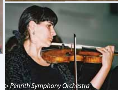
> Penrith Symphony Orchestra