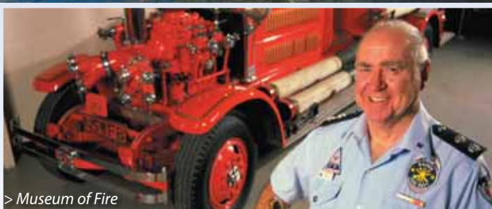
> Museum of Fire