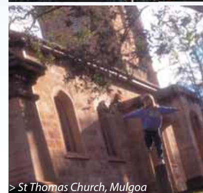
> St Thomas Church, Mulgoa