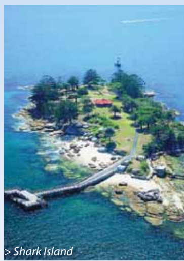
> Shark Island