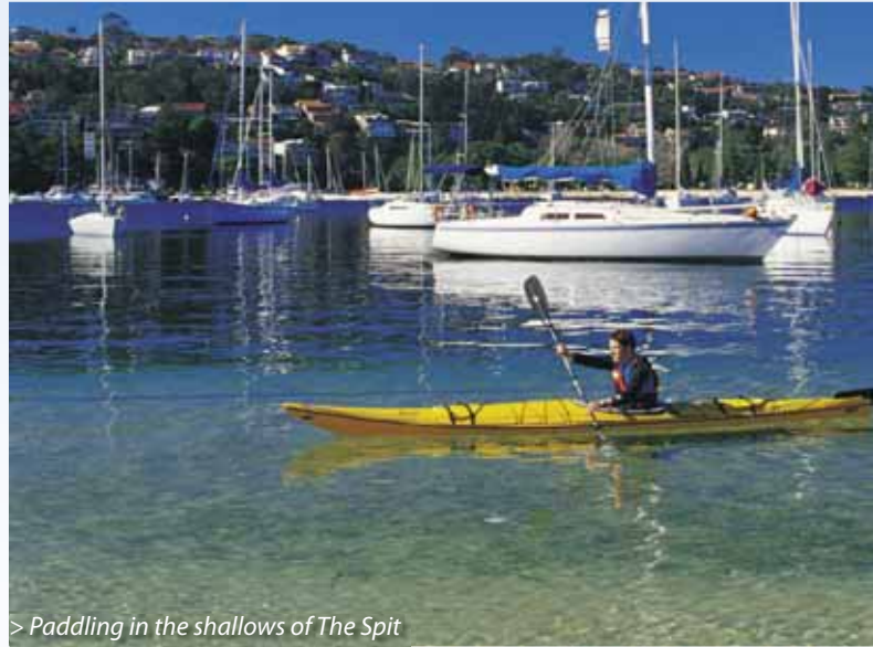
> Paddling in the shallows of The Spit

For information and links go to : www.discovergreatersydney.com.au