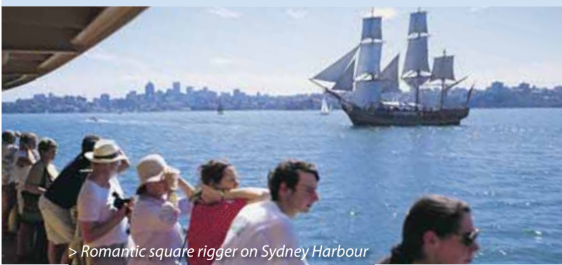
> Romantic square rigger on Sydney Harbour