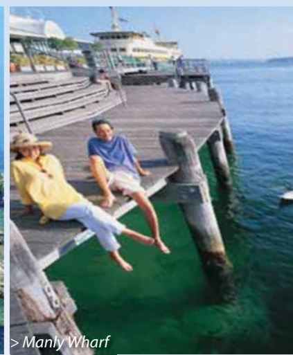
> Manly Wharf