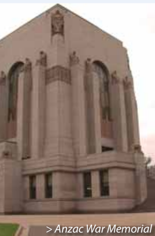
> Anzac War Memorial