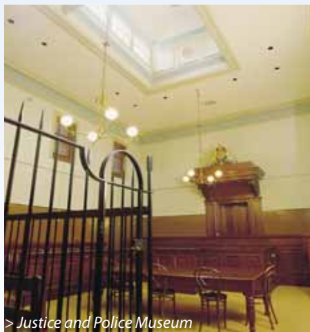
> Justice and Police Museum