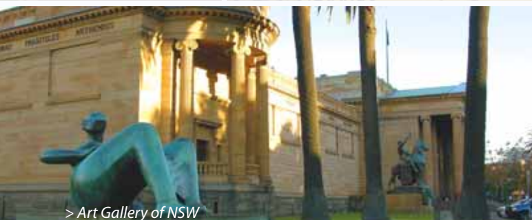
> Art Gallery of NSW