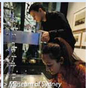
> Museum of Sydney