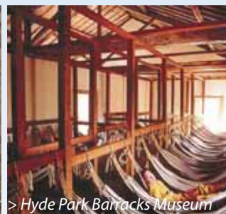
> Hyde Park Barracks Museum