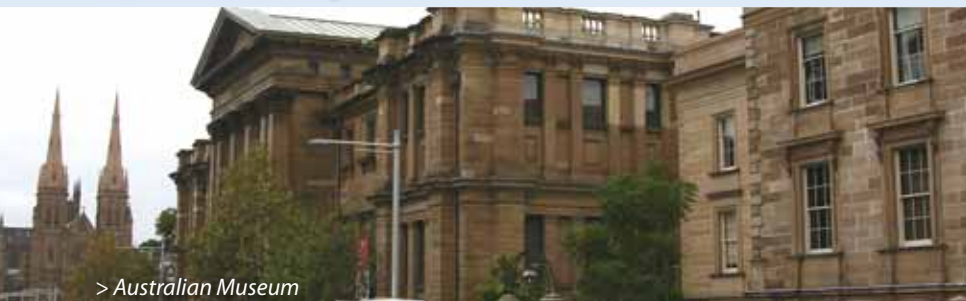
> Australian Museum